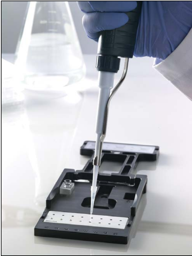
Figure 2. Take3™ plate with 16 microspots (2 \mu L) for micro-volume measurements. The plate can also accommodate 2 BioCells, and a standard 1 cm pathlength cuvette.

The Take3™ plate has a standard SBS footprint and has 16 microspots arranged as columns akin to columns 2 and 3 of a 96-well microplate. 2 \mu L volumes of a sample can be pipetted into individual microspots or a multichannel pipette may be used to load eight samples simultaneously.