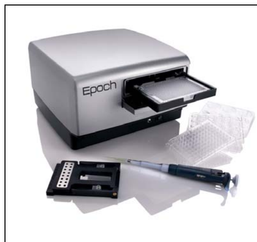
Figure 1. The Epoch™ Multi-Volume Spectrophotometer System incorporating the Epoch™ Spectrophotometer and, Take3™ Multi-Volume Plate.

The Epoch™ Multi-Volume Spectrophotometer System (Figure 1) is a flexible spectrophotometric instrument for reading 6- to 384-well microplates, micro-volume sample quantification (2 \mu L), 1 cm pathlength direct measurements using BioTek's BioCell or any standard spectrophotometric cuvette using the Take3 plate (Figure 2).