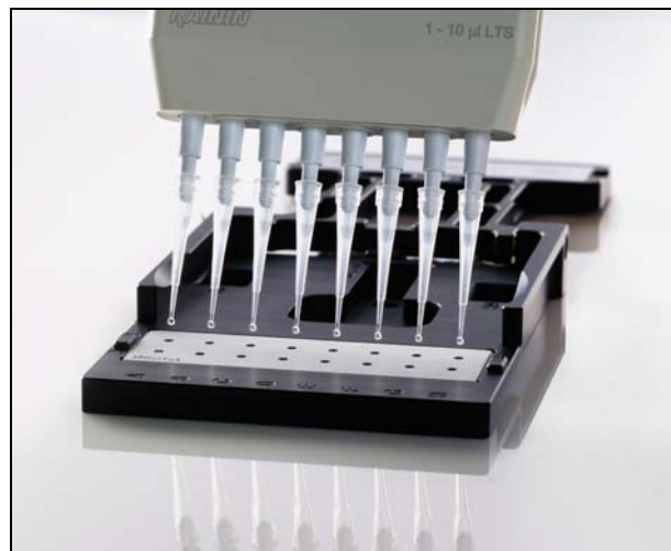
Figure 2. Loading of the Take3 Multi-Volume Plate performed with an eight-channel pipettor.

The Take3 Multi-Volume Plate has 16 microspots arranged as 8 rows and 2 columns in standard SBS format for micro-volume analysis. 2 \mu L volumes of a sample can be pipetted into individual microwells or a multichannel pipettor may be used to load eight samples simultaneously (see Figure 2).