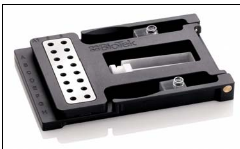
Figure 1. Take3™ Multi-Volume Plate shown with two BioCells and one standard cuvette in place.

Accurate quantification of isolated nucleic acids is required to ensure that proper amounts of starting material are introduced for maximum efficiency of enzymatic reactions that take place in downstream genomic applications. These applications include sequencing, genotyping, and both differential and quantitative gene expression analysis. Classically, quantification is performed spectrophotometrically at 260 nm in quartz cuvettes with defined measurement pathlengths of 1 cm. Recently, BioTek developed the Epoch Multi-Volume Spectrophotometer System which includes the new Take3 Multi-Volume Plate (see Figure 1). This system enables measurements in 1 cm cuvettes (including BioCell), microplates with variable measurement pathlengths (dependent on plate well geometry and volume of solution) and micro-volume measurements using a defined path length of 0.5 mm 1,2 . Micro-volume spectrophotometric measurements have the added benefit of requiring no sample dilution prior to analysis.